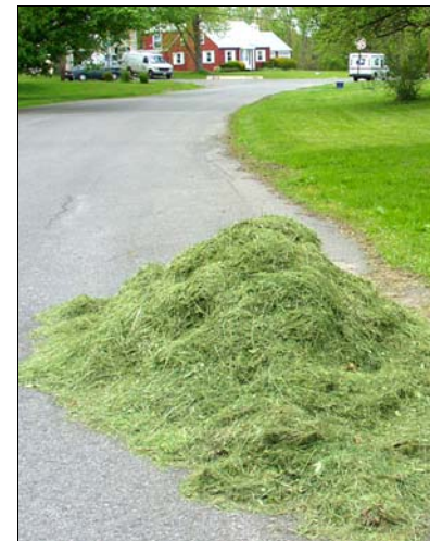
Grass clippings are more than eighty percent water, so it doesn't make sense to carry them to the street - especially since research has shown for many years that the best place for them is on your lawn!

If you're dumping your grass clippings at the curb, STOP IT!