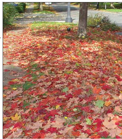
Leaves aren't garbage, so why rake them to the curb? Research has shown that mowing them into your lawn will improve its health!

Research at Cornell, Purdue, Rutgers, Michigan State and other universities have concurred for more than a decade that more than 400 pounds of dry leaves can be shredded and left on each thousand square feet of lawn each fall with no harmful effects. In fact, shredded leaves will improve lawn quality over time as organic matter and nutrients in the leaves is returned to the soil. It's absolutely amazing! You can save time, improve the quality of surface waters that run through your community and improve your lawn by never raking again! As an added bonus, your community's public works crews can devote their attention to more important matters, like fixing potholes?