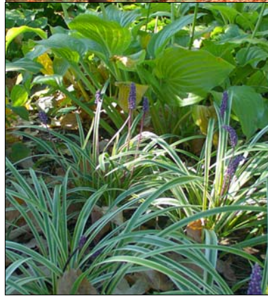
Nature intended for leaves to cover the forest floor where they return organic matter and nutrients to the soil as they decompose. The same thing happens among hostas, liriope and other perennials beneath a large tree in our front yard (at left).

Many of your landscape plantings are already enclosed in large planting beds, right? And, the lawn under many of your shade trees probably isn't looking very good, either. Instead of spending hours of your time or paying a landscape crew to "clean up" the leaves (I've never really understood this phrase as