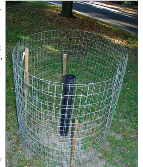
It takes ten minutes to set up a temporary woven wire compost bin in your landscape or garden. The black plastic drain-pipe allows oxygen to reach the center of the pile, speeding the decomposition process. Simply pull the bin apart in the spring, level the decomposing leaves and cover them with a thin layer of mulch.

The resulting clippings are basically a slow-release, organic lawn fertilizer. As they decompose over the course of three or four days they'll return the nutrients that they'd accumulated back to the soil. In fact, by returning grass clippings to your lawn, you can eliminate at least one application of lawn fertilizer each year!