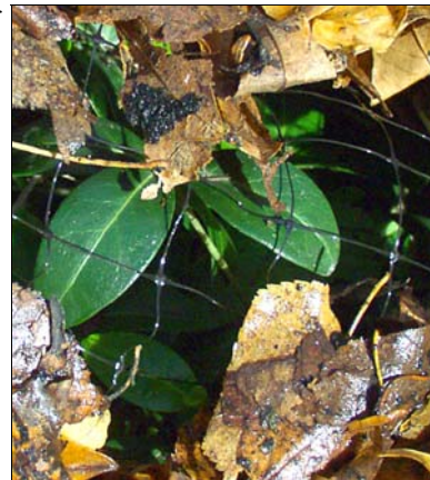
Drape fruit tree netting over ground-covers before your trees start dropping leaves. Then, after all of the leaves have dropped, simply drag the leaf-covered netting to your compost pile!

Fortunately, it's easy to keep leaves from entering storm sewers - don't rake them to the curb!